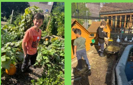
Young Farmer's enjoying the last of the October sun