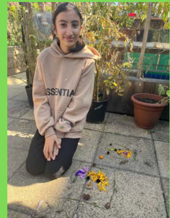
A lovely natural self-portrait created by one of our Young Farmers